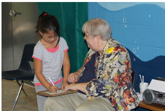
Southeast ADA Center trainer teaches a student about Braille