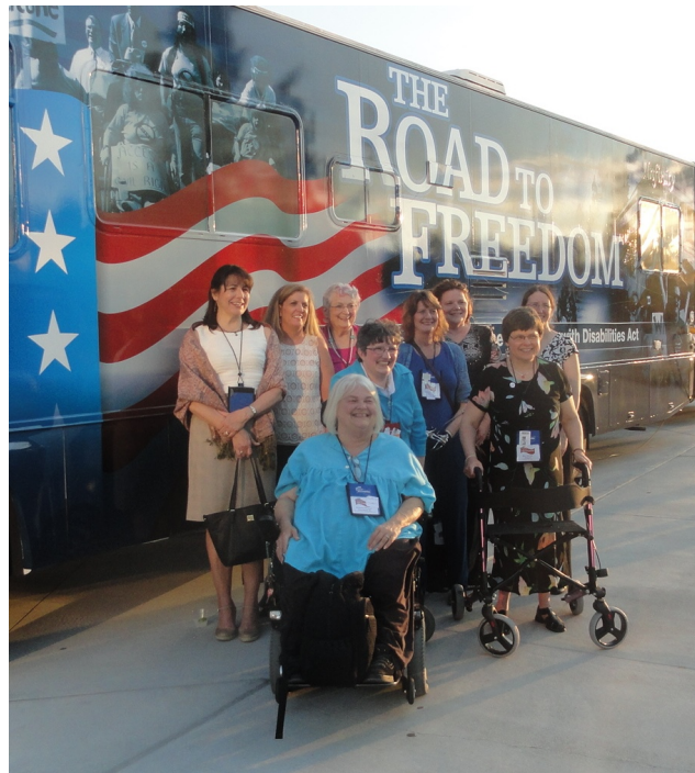
Southeast ADA Center staff celebrate ADA Anniversary